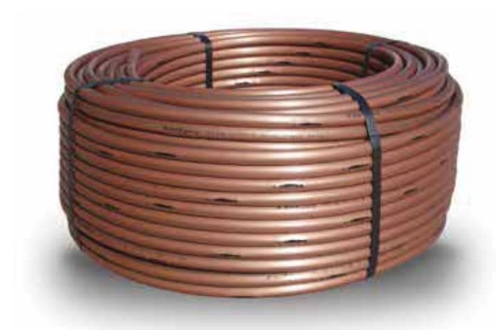
XFS Dripline offers increased flexibility easy installation.