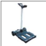
The supplied trolley allows you to move and store the cleaner quickly and easily